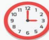
3 o' clock

Short hand - Hour hand Longer hand - Minute hand