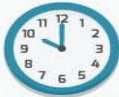
10 o' clock