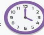
4 o' clock