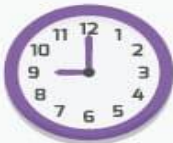
9 o' clock

Short hand - Hour hand Longer hand - Minute hand