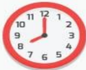
8 o' clock