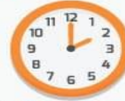
2 o' clock